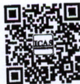
Focus on icas WeChat platform

Certification and Accreditation Administration of PRC: CNCA-R-2003-117 Tel: 400-182-9001/+86 21-51114700 Web: www.icas.org.cn Add: Room 801, HuaDing Mansion, 2368# West Zhongshan Rd., Xuhui District, Shanghai, China, 200235